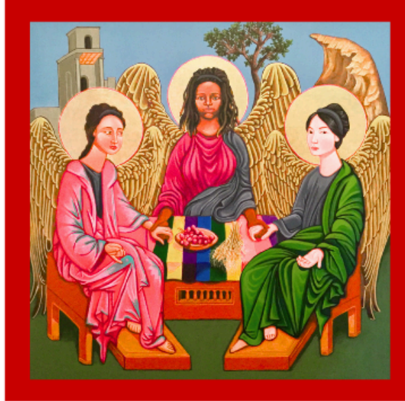
The Trinity icon by Kelly Latimore - used by permission